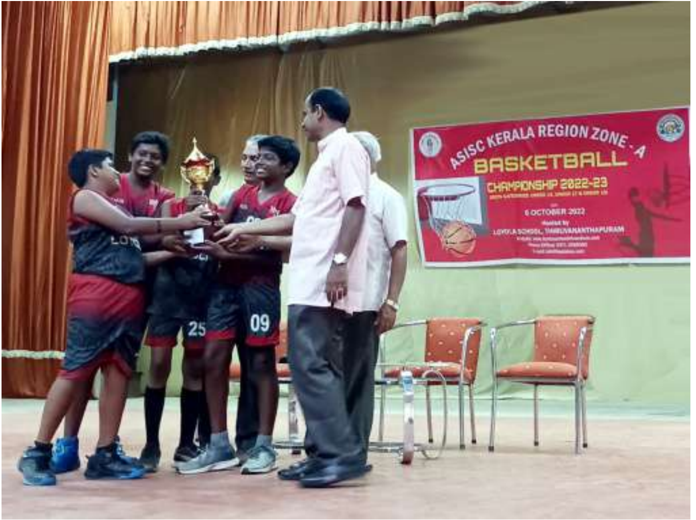
Winners in ASISC Kerala Region Zone A Basketball Championship (Under 14)