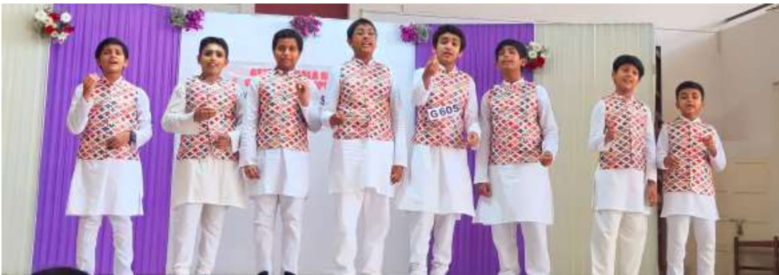
3rd in Malayalam Group Song (Category 4)