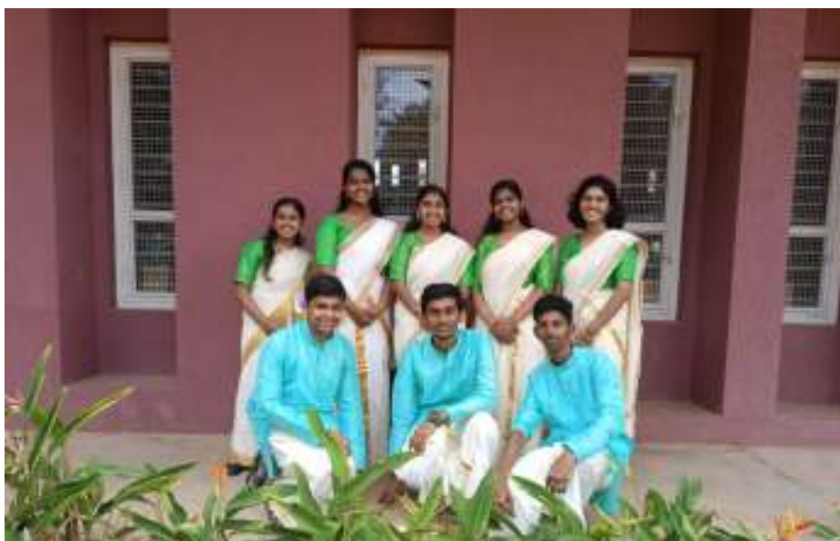
Malayalam group song team from Sarvodaya Vidyalaya