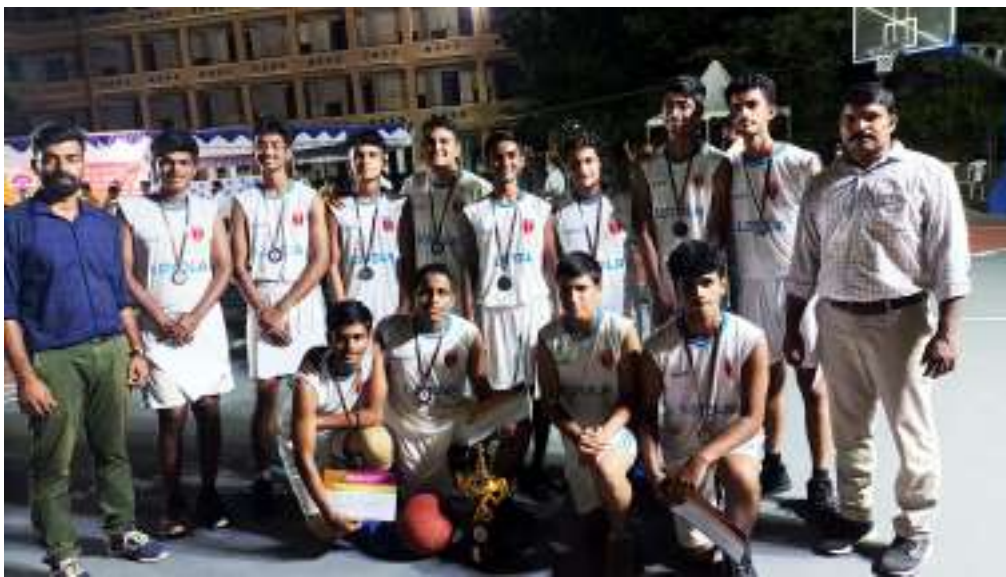
2nd Runner-up in CBSE South Zone Sahodaya Basketball Championship