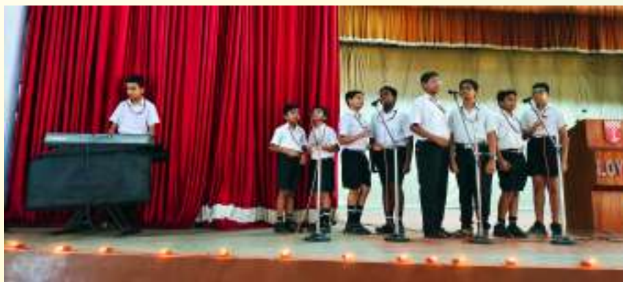
Deepawali Song by the Music Club