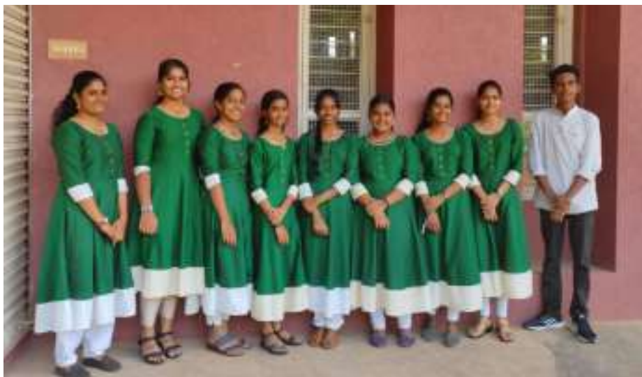
Singers waiting in the wings for their turn