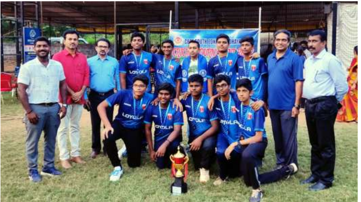
3rd in CBSE South Zone Sahodaya Cricket Championship