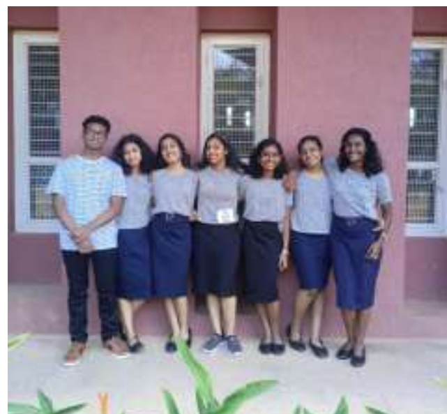
English group song team from Sarvodaya Vidyalaya