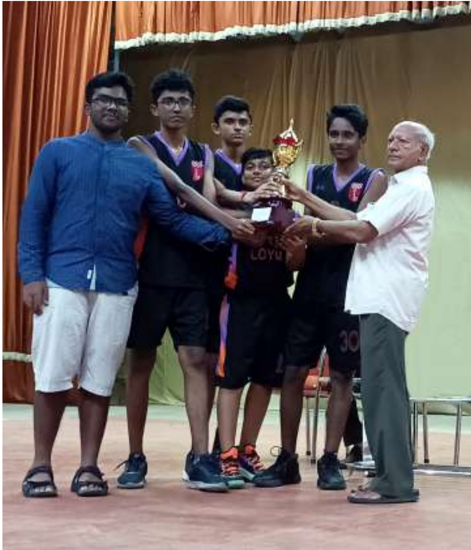
Winners in ASISC Kerala Region Zone A Basketball Championship (Under 17)