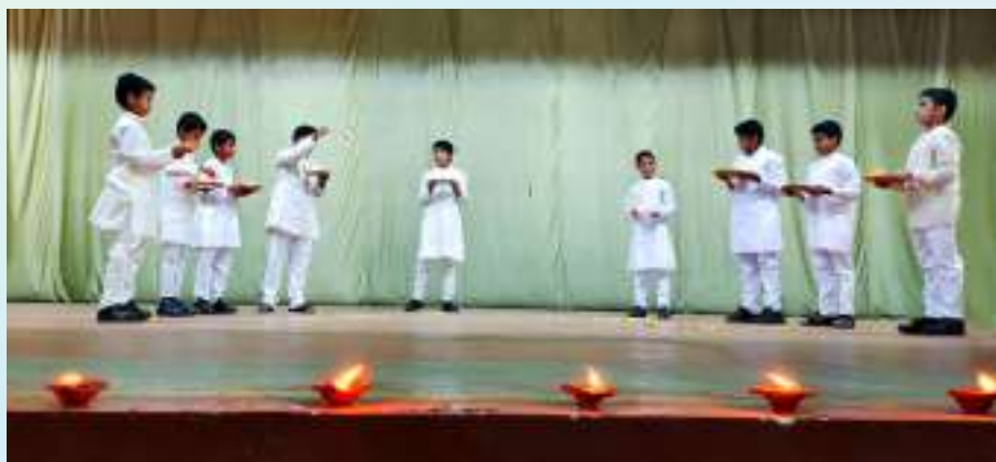
Scenes from the Music Drama